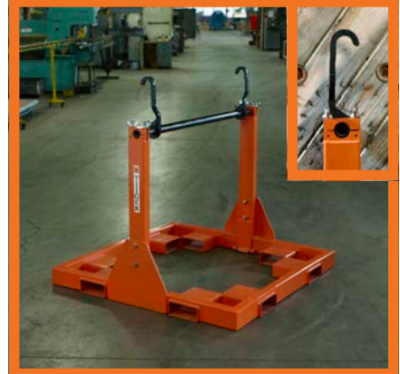
Lifting points for handling with a crane