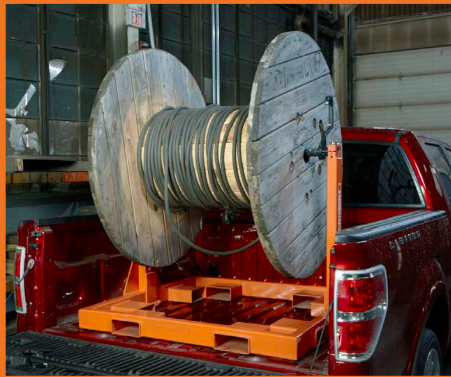
Can easily be loaded onto a pick-up truck or trailer